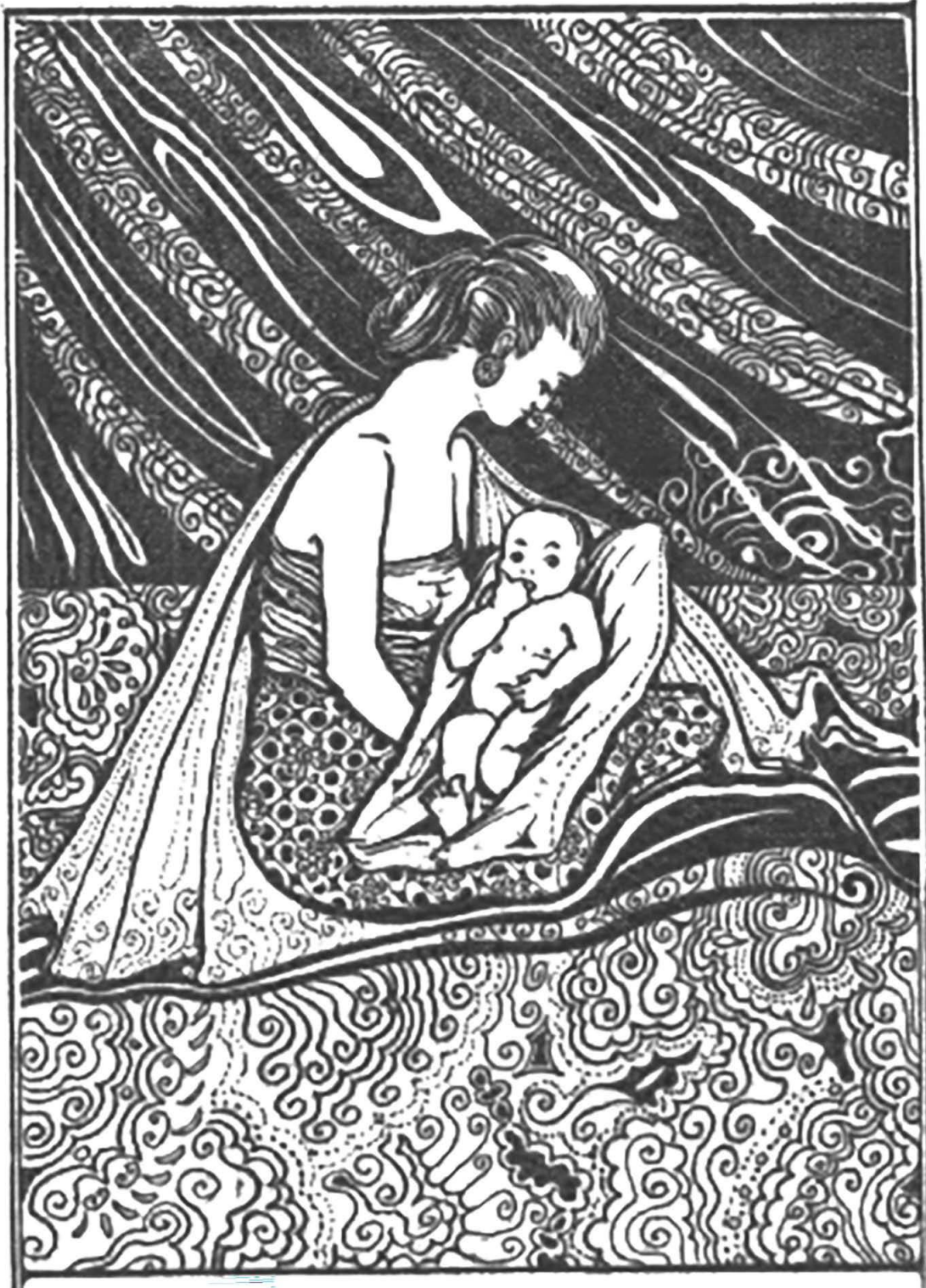
Beynon, S. (1927). Gambar 1 Henteu sabaraha lilana ti harita Prameswari kagoengan poetra istri, .... (katja 3). In Poetri Leuweung Larangan (p. 6). Bale Poestaka; Southeast Asia Digital Library. https://sea.lib.niu.edu/islandora/object/SEALimages%3A8102#page/6/mode/1up