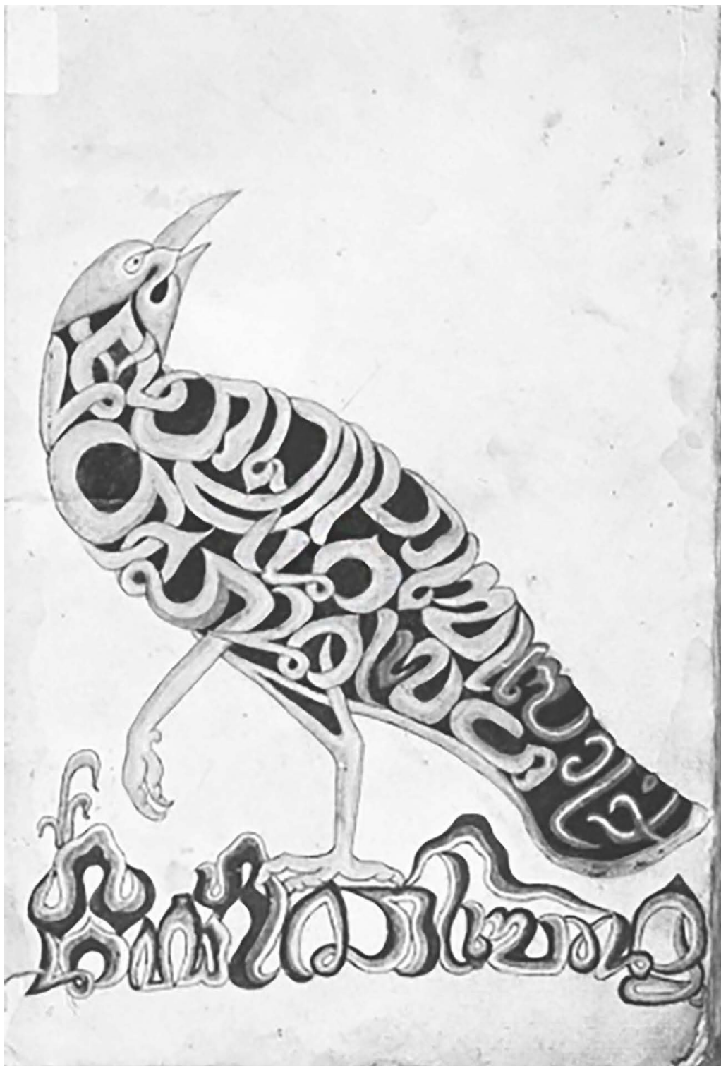
(1835). In Seat Selarasa . Southeast Asia Digital Library. https://sea.lib.niu.edu/islandora/object/SEAImages%3A1251