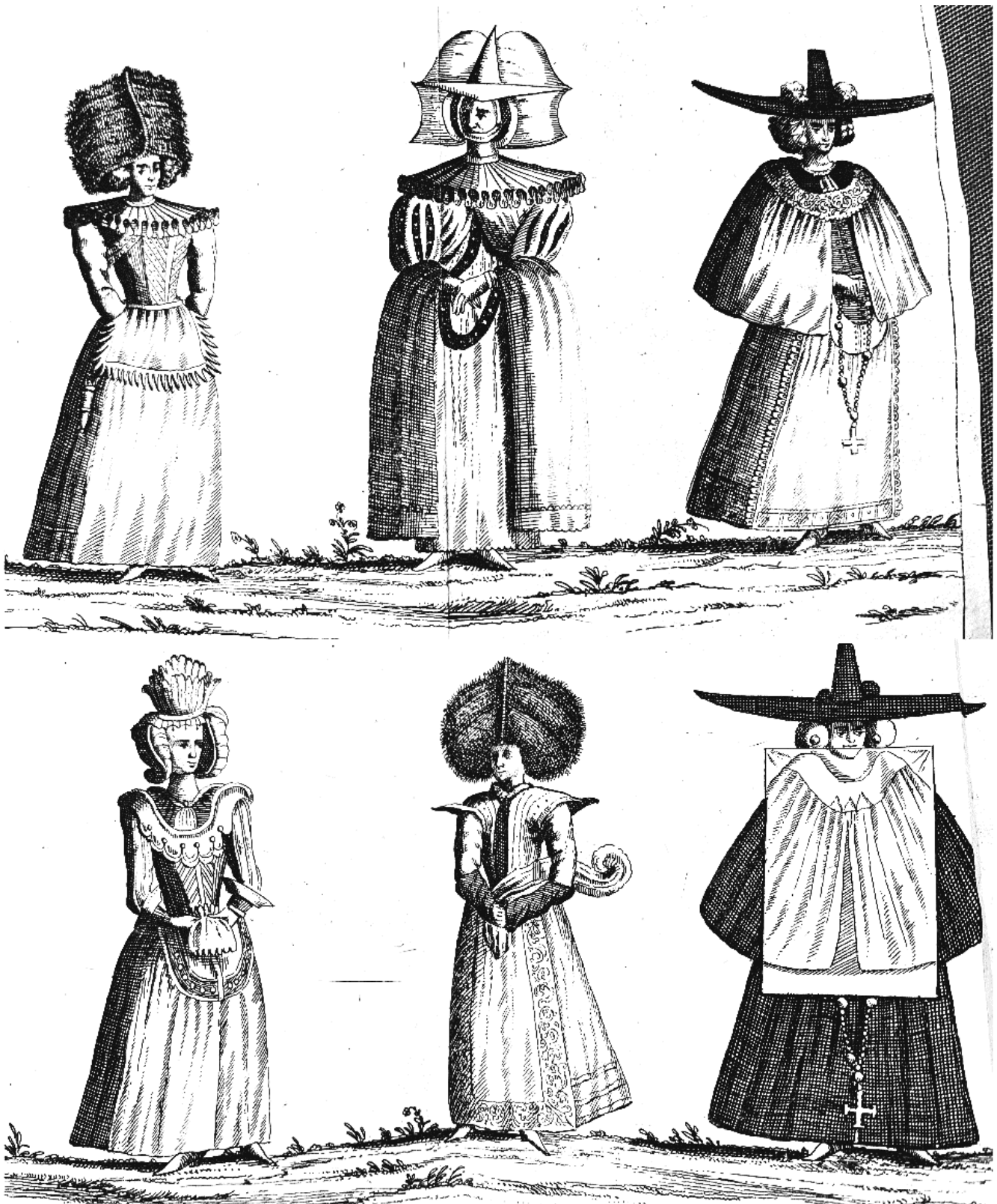
'Divers habits of the women at Ausburg', from François Maximilien Mission, A new voyage to Italy